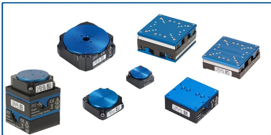
Family of Fast and Compact Direct-Drive Micro-Positioning Stages