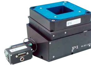
P-562.3CD PIMars™ XYZ piezo-nanopositioning & scanning system (200 µm x 200 µm x 200 µm) mounted on an M-451.1PD elevation stage