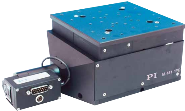
M-451.1PD precision elevation stage