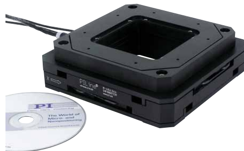
M-686 open-frame stage with P-541.2DD piezo scanner on top, providing a resolution of 0.1 nm and a scanning range of 30 x 30 \mu m. The system height of the combination with the P-541 XY (or Z) piezo scanner is only 48 mm