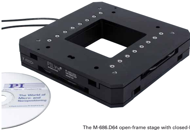
The M-686.D64 open-frame stage with closed-loop piezo motors provides 25 x 25 mm travel range