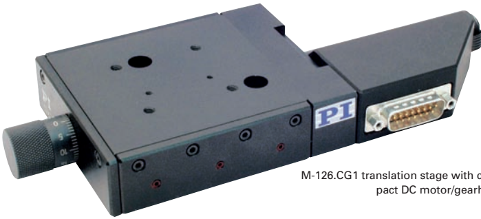
M-126.CG1 translation stage with compact DC motor/gearhead